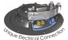
Unique Electrical Connection

sleek modern powerful innovative effortless